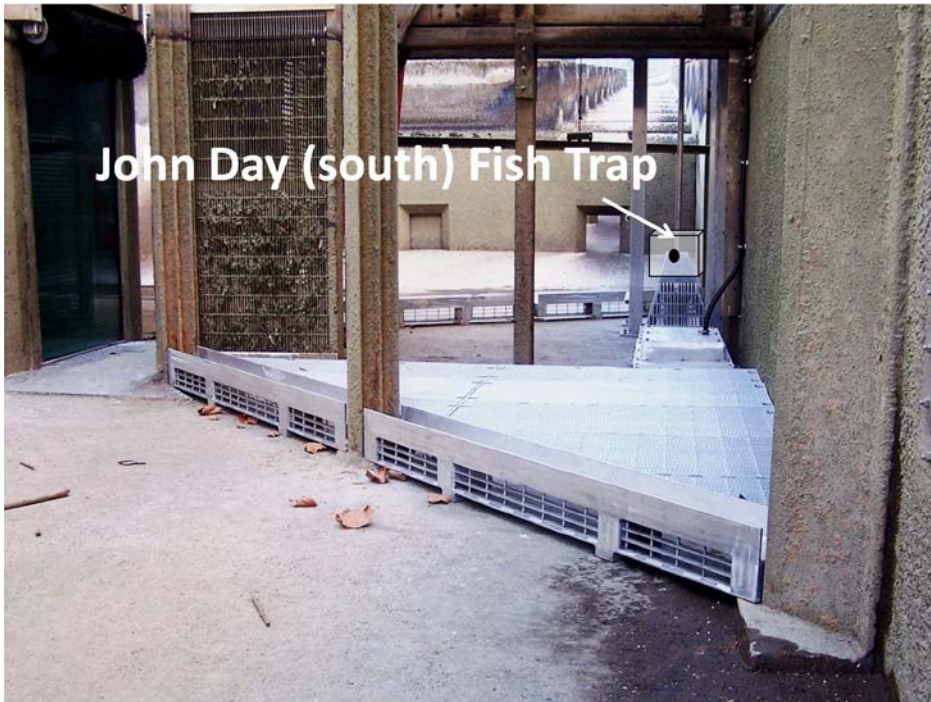
Figure 2 John Day South picket lead trap site